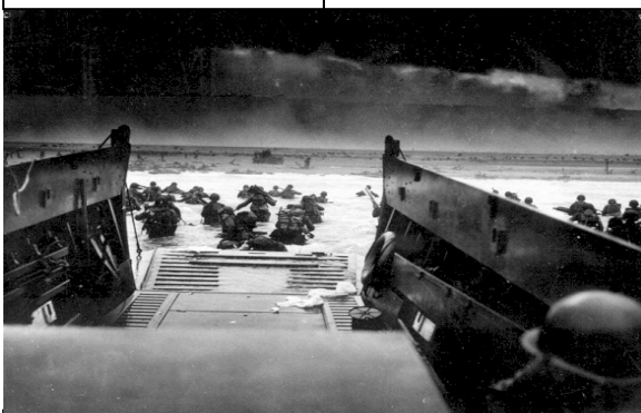
US Infantry hit the beach on DDay, June 6th, 1944

Come and see how the common man overcame a ferocious adversary to bring freedom and liberation to Europe! Meet with historians and get a first-hand look at some of the vehicles, weapons, uniforms, and equipment that helped win the war!