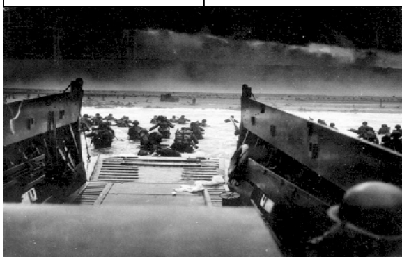
US Infantry hit the beach on D-Day, June 6th, 1944

Come and see how the common man overcame a ferocious adversary to bring freedom and liberation to Europe! Meet with historians and get a first-hand look at some of the vehicles, weapons, uniforms, and equipment that helped win the war!